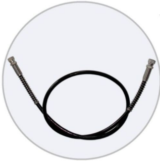
High pressure tube