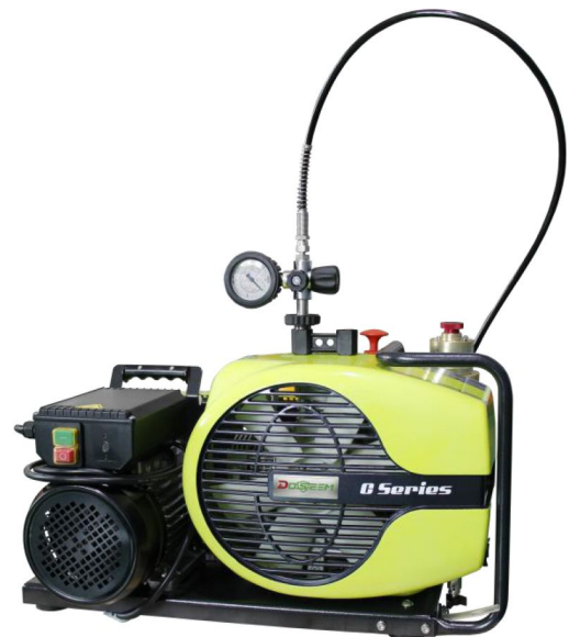
Article number: 06003