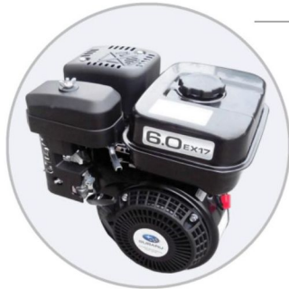
SUBARU Petrol Engine