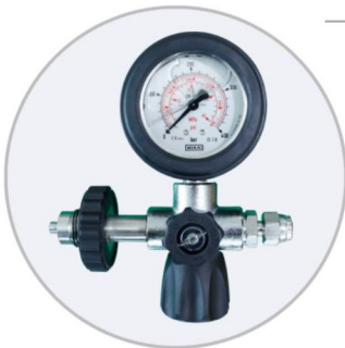
Filling Valve With Gauge