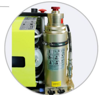
Active Carbon Molecular Sieve Filter