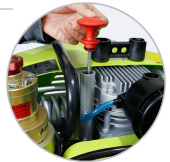
Oil Filling Barrel