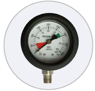
Article number: 02071

The combination of a high-voltage gauge and a residual alarm can both indicate the air supply pressure of the cylinder and give an audible alarm when the cylinder reaches the design approval pressure.