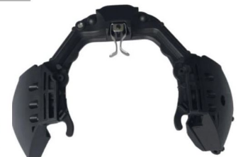
Full face mask DSM-1