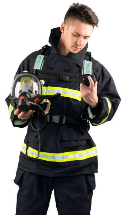
Article number: 01019

DSBA6.8CT uses state-of-the-art harness materials designed to withstand the high wear and tear that operation personnel face every day. The product is equipped with a durable stainless steel lock and a long-life aramid blending belt, making it ideal for long wear and frequent use.