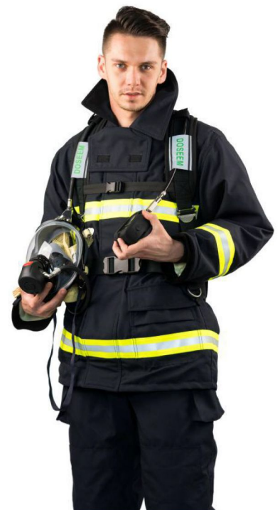
Article number: 01017

DSBA6.8/A uses state-of-the-art harness materials designed to withstand the high wear and tear that operation personnel face every day. The product is equipped with a durable stainless steel lock and a long-life aramid blending belt, making it ideal for long wear and frequent use.